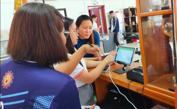
TESDA representatives inspecting on the materials, equipment and facilities for TVET Qualifications

to sustain the continuing services TVET caters to its enrollees, the inspection for the amended list of tools, equipmaterials, facilities, trainer's qualification to reregister/migrate their of programs the training qualifications namely, FBS NC II, Housekeeping NC II and Bookkeeping NC III took place on March 23, 2023.