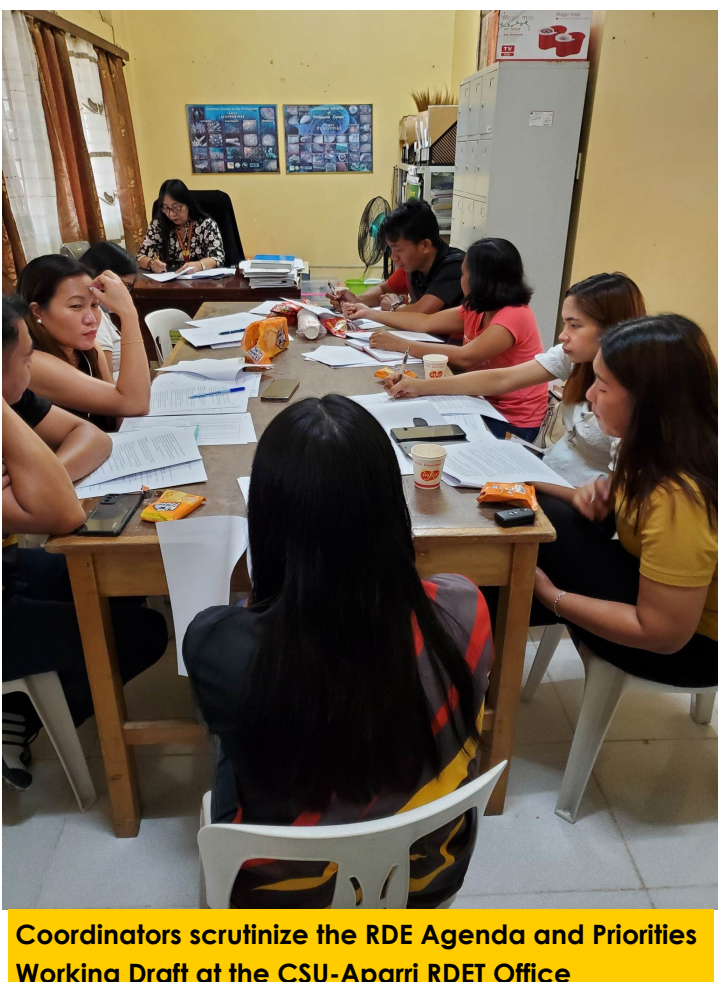
Working Draft at the CSU-Aparri RDET Office