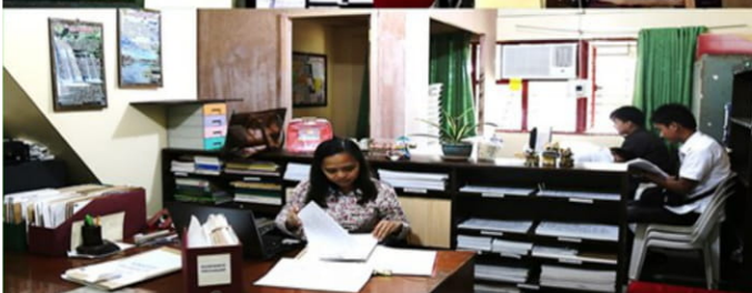
The GUIDANCE OFFICE