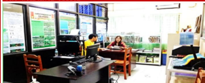
The RESEARCH & EXTENSION OFFICE