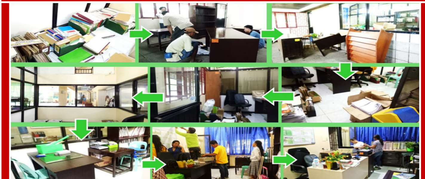
Photo glimpses of the Newly transferred and retrofitted Frontline Offices