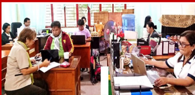
The College of Fisheries and Marine Science now occupies a more spacious Faculty Room which can accommodate the growing population of faculty and staff