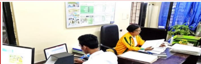
The RECORDS OFFICE

NOW: The Guidance Office can now boast its identity as the heart of the campus as it transferred to one of the offices newly acquired from the Regional Integrated Fisheries Training Center (RIFTC), making its services more felt as students can now make frequent